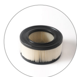
Cartridge filter (FC version)