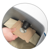
Ecological paper filter bag