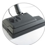
Electric power brush (optional)