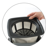
Polyester filter (FT version)