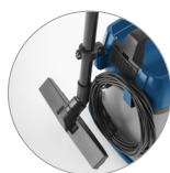
Holding system for accessories and cable