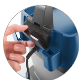
Exhaust air filter