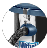
Quick hose coupling