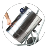
Tilting system to simplify emptying