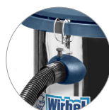
Quick hose coupling