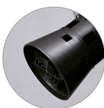
Cage bag support with floater