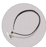
Antistatic device (IK)