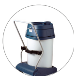
Tilting system to simplify emptying