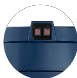
Two separately switchable motors