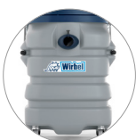
Shockproof container in plastic material