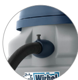
Quick hose coupling