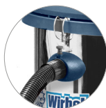
Quick hose coupling