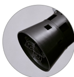
Cage bag support with floater