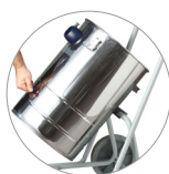
Tilting system to simplify emptying