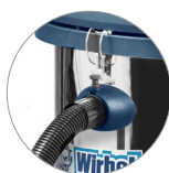
Quick hose coupling