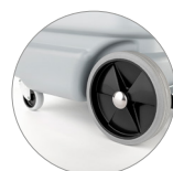
Front swivel castor wheels and rear large diameter wheels