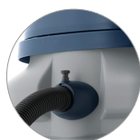
Quick hose coupling