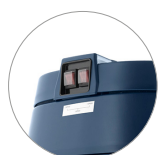
Three motors switchable