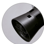
Cage bag support with floater