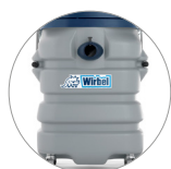
Shockproof container in plastic material