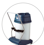
Tilting system to simplify emptying