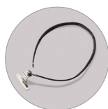
Antistatic device (IK)