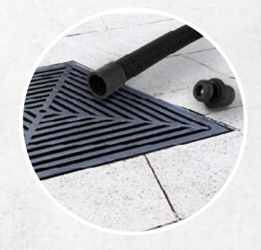
DRAIN HOSE to easily empty the 90 liters tank