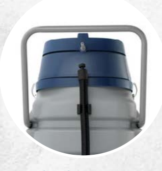
PRACTICAL HANDLE It allows to move the machine in a fast and easy way

Suitable for the hardest cleaning tasks and able to resist to impacts