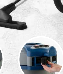
Exhaust air filter