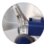
Articulation of the handle