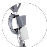
Spray electric system (optional)