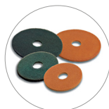
Various types of pads