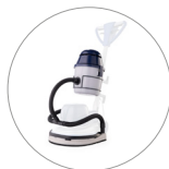
Suction kit (optional)