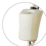
Tank 12 l (optional)