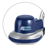
New plastic cover (L22)