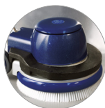
Extra weight (optional)