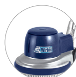
New plastic cover (L22)