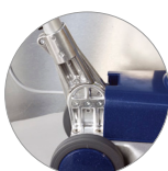
Articulation of the handle