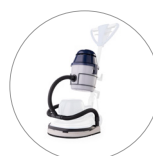
Suction kit (optional)