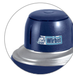
New plastic cover (M22)