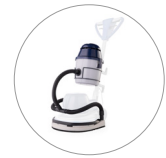
Suction kit (optional)