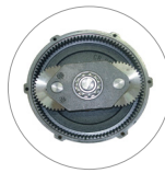
Planetary gear (M22)