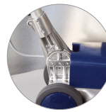
Articulation of the handle