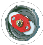
Planetary gear (M16)