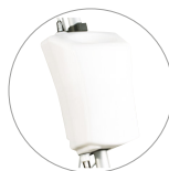
Tank 12 l (optional)