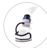
Suction kit (optional)