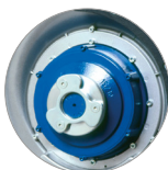
Mount for drive boards and brushes