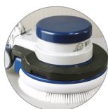
Extra weight (optional)