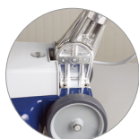
Articulation of the handle