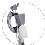
Spray electric system (optional)