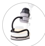
Suction kit (optional)