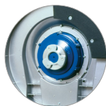
Mount for drive board and brushes