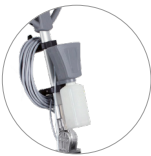
Spray electric system (optional)