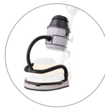
Suction kit (optional)