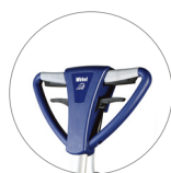
Ergonomic handle (front view)