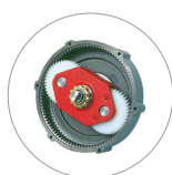
Planetary gear (L16)