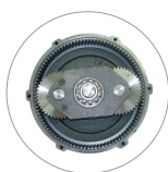
Planetary gear (L22)