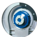
Mount for drive board and brushes