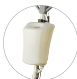
Tank 12 l (optional)