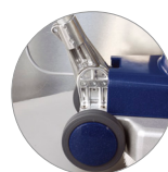
Articulation of the handle