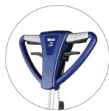
Ergonomic handle (front view)