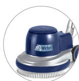
New plastic cover (L22)