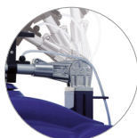
Articulation of the handle