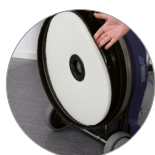
Floating pad drive system