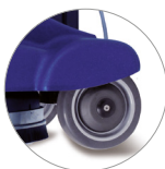
Non marking wheels