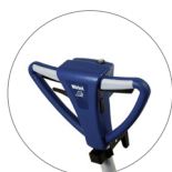
Handle (front view)