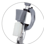
Spray electric system (optional)