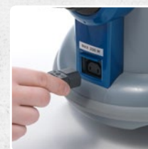
SOCKET FOR POWER BRUSH