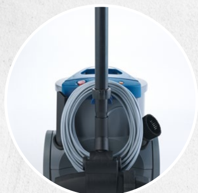
NEW FIXING SYSTEM