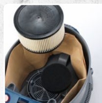
MOTOR PROTECTION FILTER + HEPA CARTRIDGE FILTER