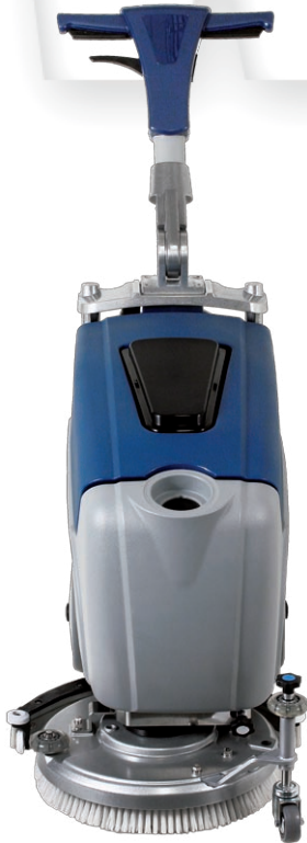
Smart “curved” design, compact dimensions

The most suitable solution for small-medium areas