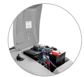
Immediate access to all main components