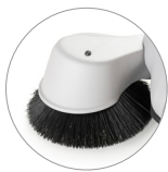
Right side brush arm