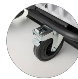
Pivoting wheel with brake