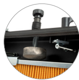
Manual filter shaker