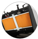
High filtering surface