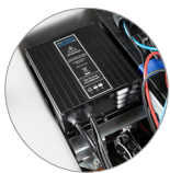
On board battery charger (BC version)