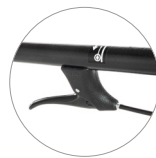
Lever for mechanical traction