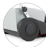
Large rear wheels