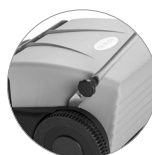
Quick stop mechanism of the handlebar