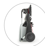
Compact dimensions: easy to store