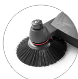
Adjustable side brushes