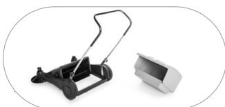
Large dirt container