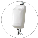
Tank 9 l (optional)