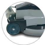
Articulation of the handle