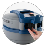
Inlet and outlet of the motor cooling air