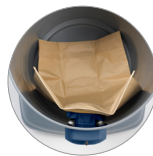
Paper filter bag (optional)