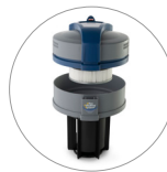
Ultra FilteRing System