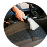
Practical and easy to use