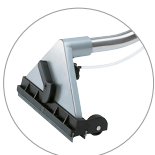
Spray-ex floor alu tool (optional)