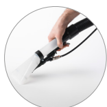
Hand spray-ex tool