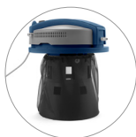
Nylon protection filter