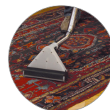
Ideal for every type of textile surface