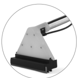
Spray-ex floor tool