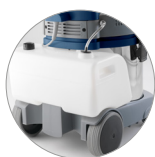
Removable solution tank