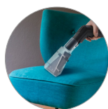
Ideal for every type of textile surface