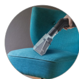
Ideal for every type of textile surface