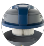
PTFE cartridge filter M filtration class