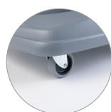
Front swivel castor wheels