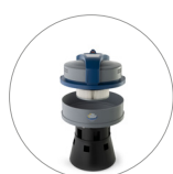
Ultra FilteRing System