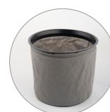
TNT filter (optional)