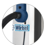
Stainless steel container sturdy and durable