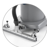
Gangway tool (optional)