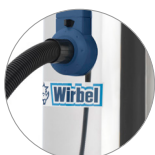
Stainless steel container sturdy and durable