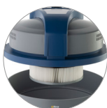
PTFE cartridge filter M filtration class