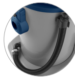
Drain hose to empty the container from liquids (PD)