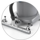
Gangway tool (optional)