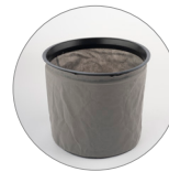
TNT filter (optional)