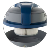
PTFE cartridge filter M filtration class