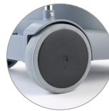
Large diameter rear wheels