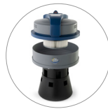
Ultra FilteRing System