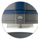
PTFE cartridge filter M filtration class