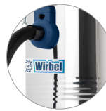
Stainless steel container sturdy and durable