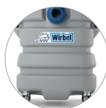
Shockproof container in plastic material