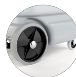
Front swivel castor wheels and rear large diameter wheels