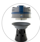
Ultra FilterRing System