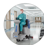
Silent mode function