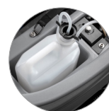
Chemical mixing system