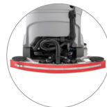
Compact squeegee with natural rubber blades