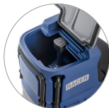
Wide recovery tank opening: easy to clean