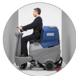
Compact dimensions, comfort in narrow spaces