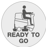
"Ready to go" function