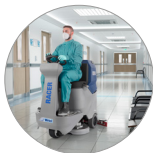
Silent mode function