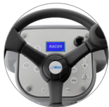
Control panel with display