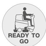
"Ready to go" function