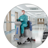
Silent mode function