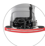
Compact squeegee with natural rubber blades