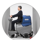
Compact dimensions, comfort in narrow spaces