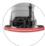
Compact squeegee with natural rubber blades