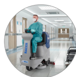
Silent mode function