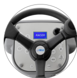
Control panel with display