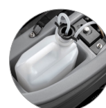
Chemical mixing system