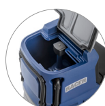
Wide recovery tank opening: easy to clean