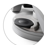
Retractable brush deck with splashguards