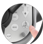
"Ready to go" function