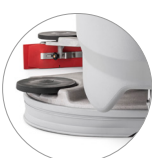
Aluminium brush head and squeegee group