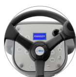
Control panel with display