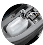
Chemical mixing system