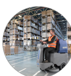
Ergonomics and comfort