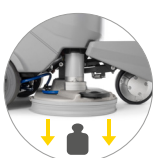
Extra down pressure