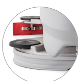
Aluminium brush head and squeegee group