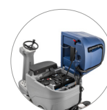
Immediate opening/ access to all the main components