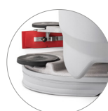
Aluminium brush head and squeegee group