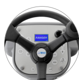
Control panel with display