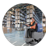
Ergonomics and comfort