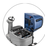
Immediate opening/ access to all the main components