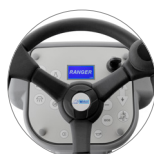
Control panel with display