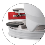
Aluminium brush head and squeegee group