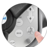
"Ready to go" function