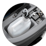
Chemical mixing system