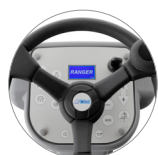
Control panel with display