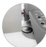
Retractable brush deck, maximum safety and practicality