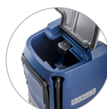
Wide recovery tank opening: easy to clean