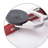
Aluminium squeegee group