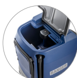
Wide recovery tank opening: easy to clean