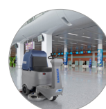
Remarkable running time, up to 7 hours (BC PLUS version)