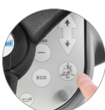
"Ready to go" function