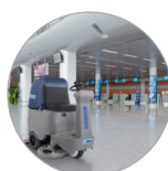
Remarkable running time, up to 7 hours (BC PLUS version)