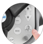
"Ready to go" function