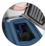
Debris tray + recovery tank filter