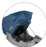
Tiltable recovery tank