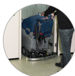
Adjustable and compact squeegee