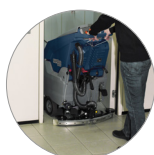
Adjustable and compact squeegee