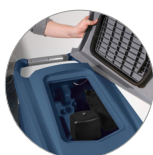
Debris tray + recovery tank filter