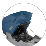
Tiltable recovery tank